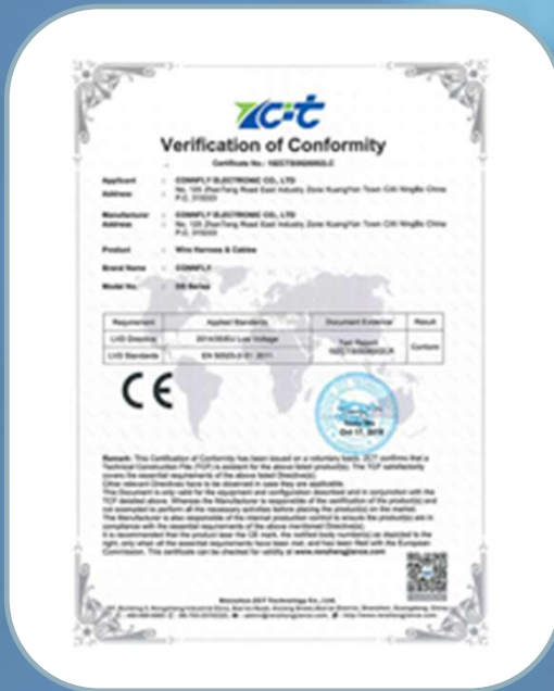
CE Wire-Harness-&-Cables ✓✓✓