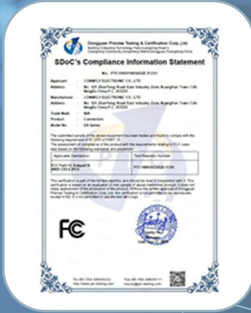
FCC Connectors ✓✓✓