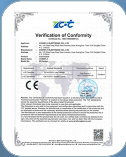
CE Connectors ✓✓✓