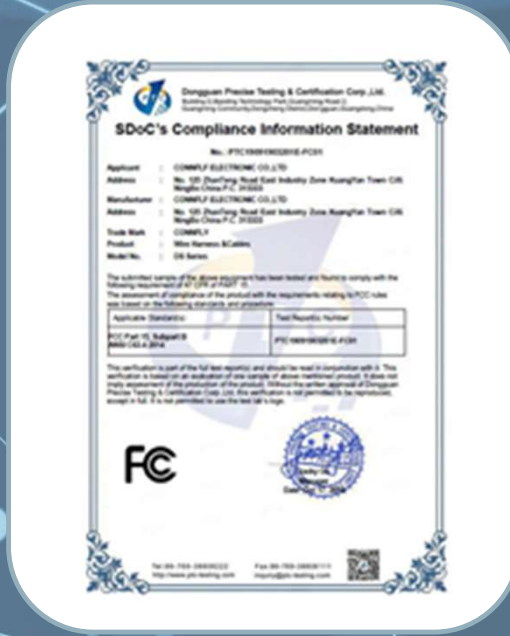
FCC Wire-Harness-&-Cables ✓✓✓